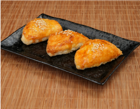
叉燒酥 CHAR SIU PUFF