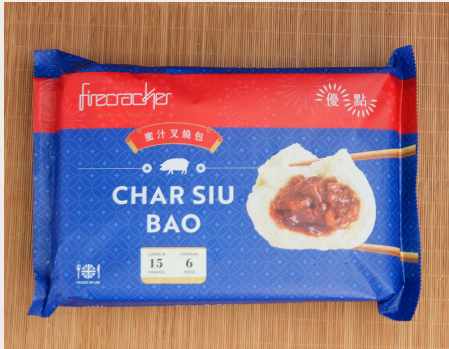
蜜汁叉燒包 CHAR SIU BAO