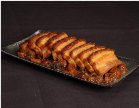
梅菜扣肉 BRAISED PORK BELLY & MUSTARD

COOKING METHOD: RETAIL PACK: 420g | Packs TRADE PACK: 280G | 40 Packs PRODUCT CODE: BRA002