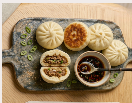
牛肉包 BEEF BAO

COOKING METHOD: STEAM RETAIL PACK: 6pcs | 360g TRADE PACK: 6pcs | 10 Packs PRODUCT CODE: HDS017