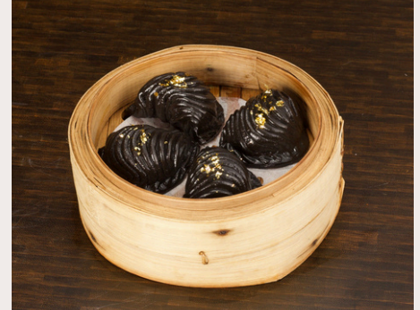
黑珍珠蝦餃 BLACK PEARL HAR GAU

COOKING METHOD: STEAM RETAIL PACK: 20pcs | 20 Packs TRADE PACK: N/A PRODUCT CODE: MDS014