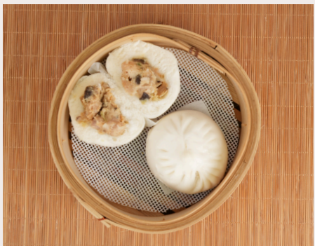
雞汁鮮肉包 CHICKEN MUSHROOM BAO

COOKING METHOD: STEAM RETAIL PACK: 6pcs | 360g TRADE PACK: 6pcs | 10 Packs PRODUCT CODE: HDS016