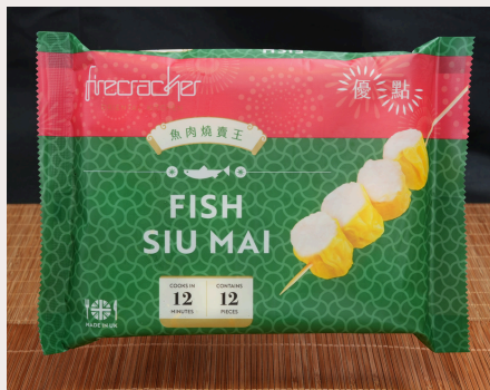
魚肉燒賣王 FISH SIU MAI

COOKING METHOD: STEAM RETAIL PACK: 12pcs | 20 Packs TRADE PACK: 12pcs | 20 Packs PRODUCT CODE: MDS010