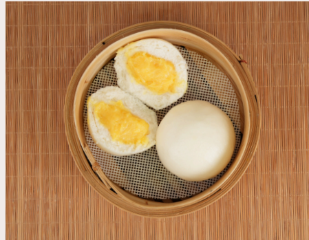
香滑奶皇包 CUSTARD BAO

COOKING METHOD: STEAM RETAIL PACK: 6pcs | 380g TRADE PACK: 6pcs | 10 Packs PRODUCT CODE: HDS013