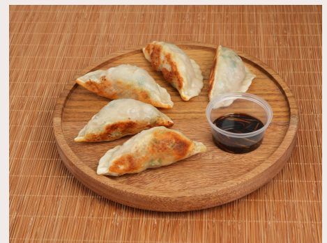
北京鍋貼 PEKING DUMPLING

COOKING METHOD: STEAM OR PANFRIED RETAIL PACK: 12pcs | 20 Packs TRADE PACK: N/A PRODUCT CODE: MDS011