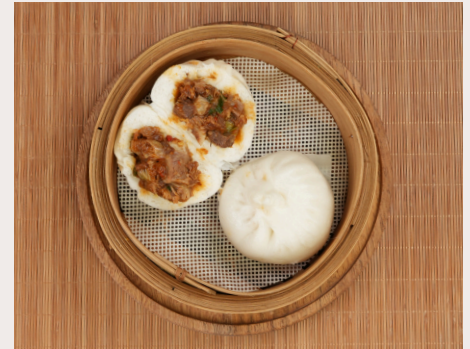
香辣羊肉包 SPICY LAMB BAO

COOKING METHOD: STEAM RETAIL PACK: 6pcs | 380g TRADE PACK: 6pcs | 10 Packs PRODUCT CODE: HDS014