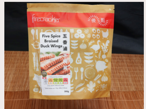
五香滷水鴨翼 FIVE SPICE DUCK WINGS

COOKING METHOD: RETAIL PACK: 440g TRADE PACK: 440g | 24 Packs PRODUCT CODE: BRA014