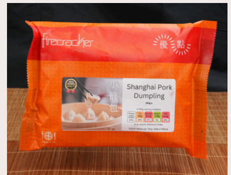
小籠包 SHANGHAI PORK DUMPLING

COOKING METHOD: STEAM RETAIL PACK: 12pcs | 20 Packs TRADE PACK: 60pcs | Pack PRODUCT CODE: HDS005