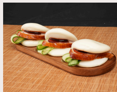
台灣刈包 TAIWANESE GUA BAO

COOKING METHOD: STEAM | PAN-FRIED RETAIL PACK: N/A TRADE PACK: 30pcs | 6 Packs PRODUCT CODE: HDS028