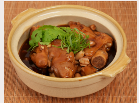
南乳花生燜豬手 BRAISED PIG TROTTERS WITH NAM YU BEANCURD

COOKING METHOD: RETAIL PACK: 450g | 24 Packs TRADE PACK: N/A PRODUCT CODE: BRA006