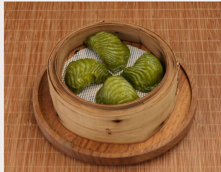
南方韭菜蝦餃 SOUTHERN PRAW CHIVES DUMPLING

COOKING METHOD: STEAM RETAIL PACK: N/A TRADE PACK: 40pcs | 12 Packs PRODUCT CODE: MDS003