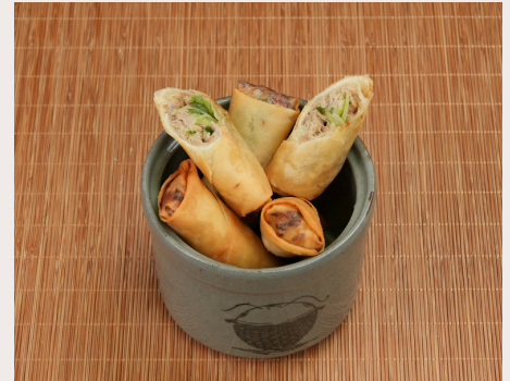
鴨卷 HANDMADE AROMATIC DUCK ROLL

COOKING METHOD: FRY RETAIL PACK: 400g include Sauce TRADE PACK: 3Kg | 4 Packs PRODUCT CODE: FRY007