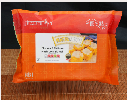
香菇雞肉燒賣 CHICKEN & SHIITAKE MUSHROOM SIU MAI

COOKING METHOD: STEAM RETAIL PACK: 12pcs | 20 Packs TRADE PACK: 12pcs | 20 Packs PRODUCT CODE: MDS016