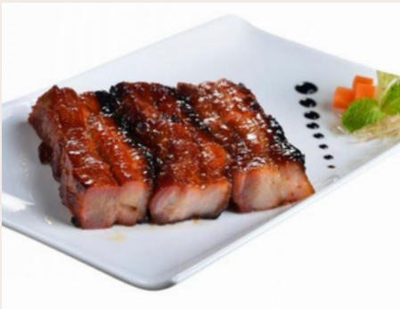
蜜汁叉燒 CHAR SIU

COOKING METHOD: ROAST RETAIL PACK: 280g | Packs TRADE PACK: 280G | 24 Packs PRODUCT CODE: ROA001T5