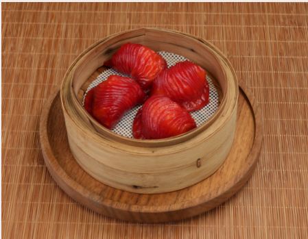
南方蝦餃 SOUTHERN PRAW DUMPLING

COOKING METHOD: STEAM RETAIL PACK: 16pcs TRADE PACK: 80pcs | 6 Packs PRODUCT CODE: MDS015