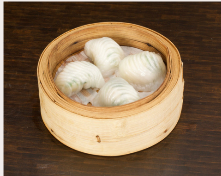
鮮蝦韭菜餃 PRAWN & CHIVES DUMPLING

COOKING METHOD: STEAM RETAIL PACK: 12pcs | 22 Packs TRADE PACK: 80pcs | 6 Packs PRODUCT CODE: MDS001