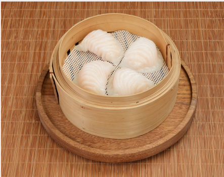
港式鮮蝦餃 PRAWN DUMPLING (HAR GAU)

Prawn Dumpling in white translucent pastry