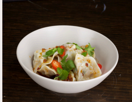
韭菜猪肉水餃 PORK AND CHIVES POACHED DUMPLING

COOKING METHOD: STEAM RETAIL PACK: 20pcs | 20 Packs TRADE PACK: N/A PRODUCT CODE: MDS013