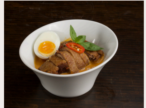
香酥鴨 AROMATIC DUCK

COOKING METHOD: FRY RETAIL PACK: N/A TRADE PACK: 30pcs | 4 Packs PRODUCT CODE: FRY003