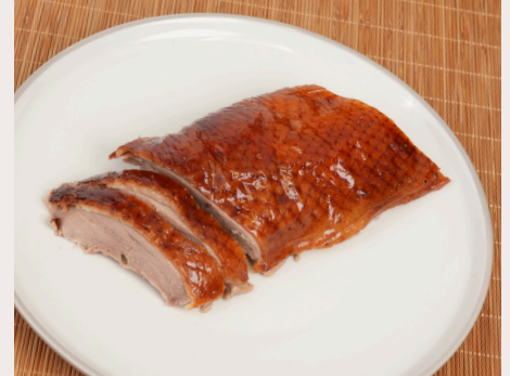
明爐燒鴨胸 ROAST DUCK BREAST

COOKING METHOD: ROAST RETAIL PACK: 250g | Packs TRADE PACK: 250G | 24 Packs PRODUCT CODE: ROA001T6