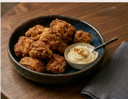
日式炸雞 HANDMADE CHICKEN KARAAGE

COOKING METHOD: FRY RETAIL PACK: 900g e TRADE PACK: 900g e | 10 Packs PRODUCT CODE: FRY005