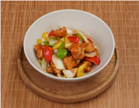
梅汁咕嚕雞 SWEET & SOUR CHICKEN

COOKING METHOD: FRY RETAIL PACK: 400g include Sauce TRADE PACK: 3Kg | 4 Packs PRODUCT CODE: FRY006