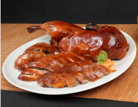
明爐燒鴨 ROAST DUCK