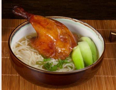
明爐燒鴨脾 ROAST DUCK LEG

COOKING METHOD: ROAST RETAIL PACK: Whole TRADE PACK: Whole | 8 Packs PRODUCT CODE: ROA001T1