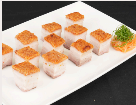
脆皮燒肉 CRISPY BELLY PORK

COOKING METHOD: ROAST RETAIL PACK: Vacuum Packed 400g | 24 Packs TRADE PACK: Vacuum Packed 1kg | 10 Packs PRODUCT CODE: ROA002T2