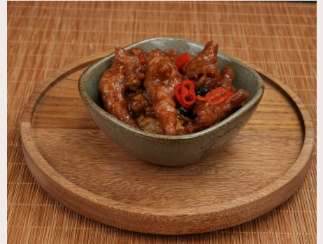
豉汁虎皮鳳爪 CHICKEN FEET IN BLACKBEAN SAUCE

COOKING METHOD: BAKE RETAIL PACK: N/A TRADE PACK: 60pcs | Pack PRODUCT CODE: HDS011