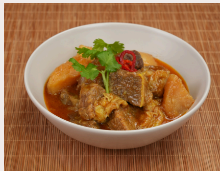
咖喱牛筋腩 CURRY BEEF BRISKET, TENDON & POTATO

COOKING METHOD: RETAIL PACK: 450g TRADE PACK: 450g | 24 Packs PRODUCT CODE: BRA011