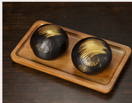
黑金流沙包 BLACK GOLD LAVA BUNS

COOKING METHOD: STEAM RETAIL PACK: 6pcs | 360g TRADE PACK: 6pcs | 10 Packs PRODUCT CODE: HDS021