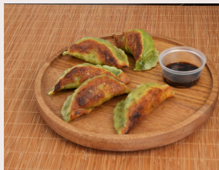
菠菜雞肉鍋貼 CHICKEN & SPINACH DUMPLING

COOKING METHOD: STEAM RETAIL PACK: N/A TRADE PACK: 40pcs | 12 Packs PRODUCT CODE: MDS006