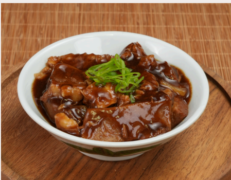
柱候牛腩 BRAISED BEEF BRISKET IN CHU HOU SAUCE

COOKING METHOD: RETAIL PACK: 550g | 24 Packs TRADE PACK: N/A PRODUCT CODE: BRA010