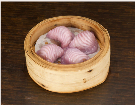
齋餃 VEGAN DUMPLING PURPLE

COOKING METHOD: STEAM RETAIL PACK: N/A TRADE PACK: 40pcs | 12 Packs PRODUCT CODE: MDS005