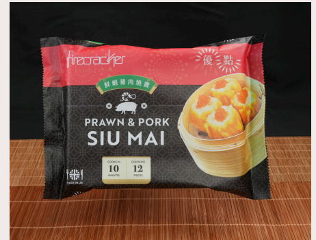
鮮蝦豬肉燒賣 PRAWN & PORK SIU MAI

COOKING METHOD: STEAM RETAIL PACK: 12pcs | 22 Packs TRADE PACK: 80pcs | 6 Packs PRODUCT CODE: MDS002