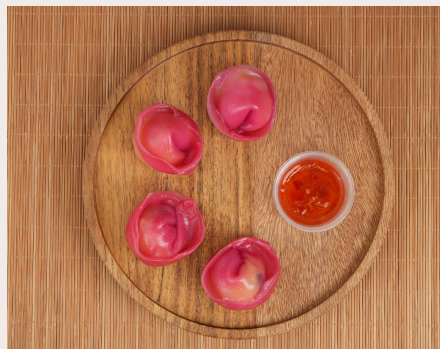
手做帶子餃 SCALLOP DUMPLING

COOKING METHOD: STEAM RETAIL PACK: N/A TRADE PACK: 80pcs | Pack PRODUCT CODE: HDS009