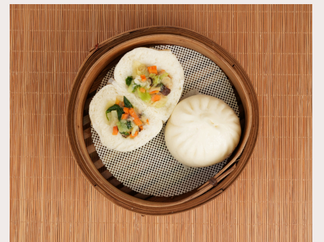
香菇菜包 MUSHROOM VEGETABLE BAO

COOKING METHOD: STEAM RETAIL PACK: 6pcs | 360g TRADE PACK: 6pcs | 10 Packs PRODUCT CODE: HDS018