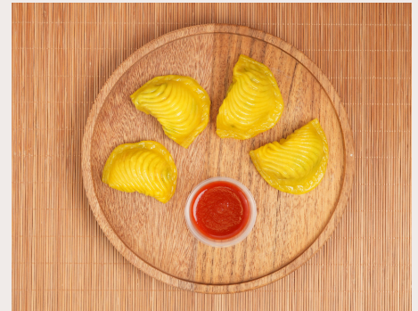
雞肉潮州粉果 CHICKEN CHIU CHOW DUMPLING YELLOW

COOKING METHOD: STEAM RETAIL PACK: N/A TRADE PACK: 40pcs | 12 Packs PRODUCT CODE: MDS004