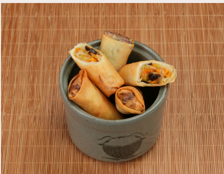
齋卷 HANDMADE VEGAN ROLL

COOKING METHOD: FRY RETAIL PACK: N/A TRADE PACK: 30pcs | 4 Packs PRODUCT CODE: FRY001