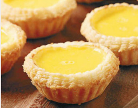
蛋撻皮 EGG TART PASTRY

COOKING METHOD: BAKE RETAIL PACK: 4pcs | Pack TRADE PACK: 30pcs | Pack PRODUCT CODE: HDS010