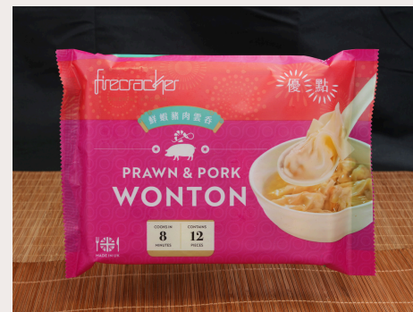
鮮蝦豬肉雲吞 PRAWN & PORK WONTON

COOKING METHOD: STEAM RETAIL PACK: 12pcs | 20 Packs TRADE PACK: 12pcs | 20 Packs PRODUCT CODE: HDS003