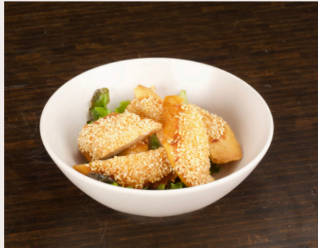
法包芝麻蝦 SESAME PRAWN TOAST

COOKING METHOD: FRY RETAIL PACK: N/A TRADE PACK: 30pcs | 4 Packs PRODUCT CODE: FRY002