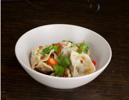
白菜猪肉水餃 PORK AND CHINESE LEAVES POACHED DUMPLING