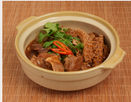
牛三寶 BEEF TRIO (BRISKET, STOMACH & TENDON)

COOKING METHOD: RETAIL PACK: 420g | Packs TRADE PACK: 280G | 40 Packs PRODUCT CODE: BRA002