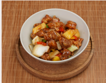
梅汁咕嚕肉 SWEET & SOUR PORK

COOKING METHOD: FRY RETAIL PACK: 400g include Sauce TRADE PACK: 3Kg | 4 Packs PRODUCT CODE: FRY006